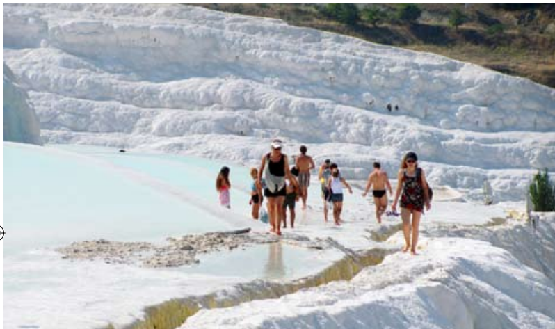
Limestone terraces with travertine pools in Pamukkale

The town of Pamukkale, located 12 miles (20 km) outside of the region's major city, Denizli, is situated at the base of the travertine cliffs that have become one of Turkey's top sights. Another major attraction on the hill above is the ancient site of Hierapolis, which translates as "sacred city." The thermal waters of this site are deemed healing, and consequently attract thousands of international tourists and locals alike.