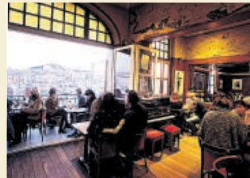
Watch night fall over the Vieux Port after taking in (from far left) the day's catch on sale, le Corbusier dwellings, atmospheric old streets, and an aperitif at La Caravelle.

have been crafting chocolates according to a secret family recipe.